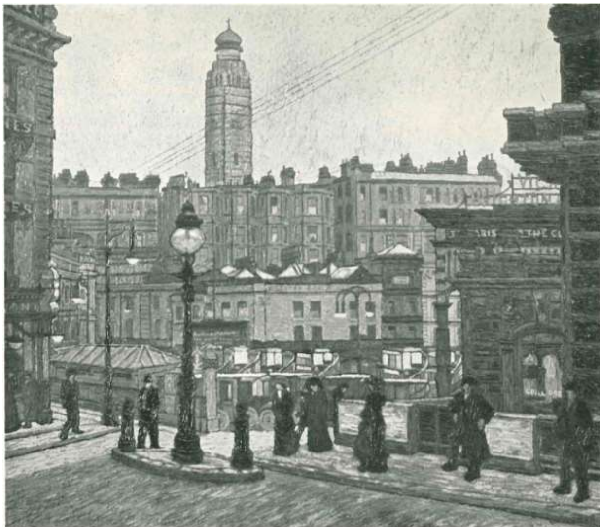
Charic<1 Ginner: Victoria Station

exciting time for English painting; there might be some wrangling as to what was the chief motor force of the excitement, but certainly no better moment could have been chosen for the foundation of such a group as the Contemporary Art Society.